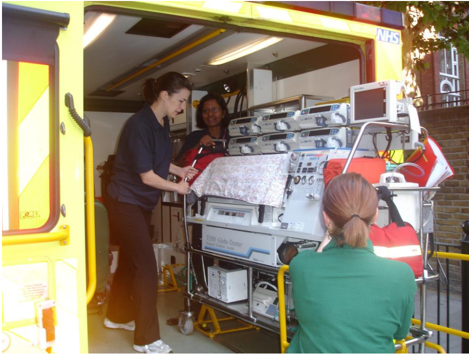
The incubator is put in a special ambulance to go to the other hospital.