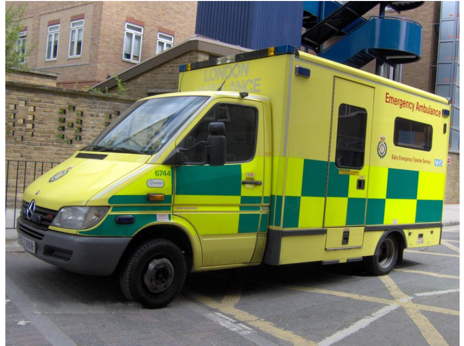
The Team looking after your baby will travel with your baby in the ambulance.